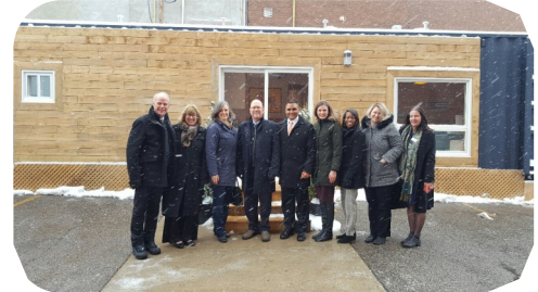
Minister of Housing visits Microhome

The arrival of colder weather sees us putting the finishing touches on many large projects at our existing housing sites. These include new roofs, mechanical equipment, life safety systems and energy efficient upgrades. We appreciate everyone’s support and patience during this construction time.