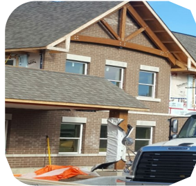
Cannington Seniors Building

As we reflect on the past year, 2019 has sure been a busy one for Durham Region Non-Profit Housing with fresh, innovative projects. In addition to our regular operations, we are in process of completing a new 50 unit seniors building in Cannington, we have delivered a “Microhome” model pilot project available for viewing at our head office in Oshawa and welcomed 18 new households to our newly built apartments in Beaverton. With the support of a phenomenal staff team and strong leadership from our Board of Directors, we continue to adapt and grow our housing portfolio to meet the growing housing needs of our community.