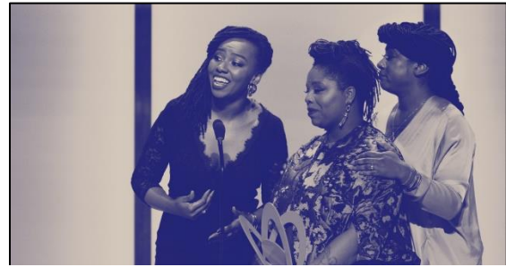
Opal Tometi with her Black Lives Matter co-founders Patrisse Cullors and Alicia Garza (pictured left to right) at an awards ceremony, in 2016.